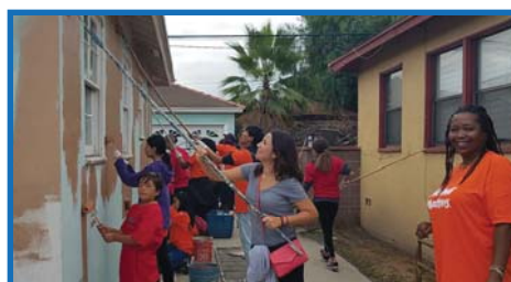
NHS hosted Compton Neighborhood Pride Day on September 29th, where over 150 volunteers converged on West 138th Street to paint two houses, provide minor repairs, plant gardens, remove bulky trash and clean up along the Compton Creek.