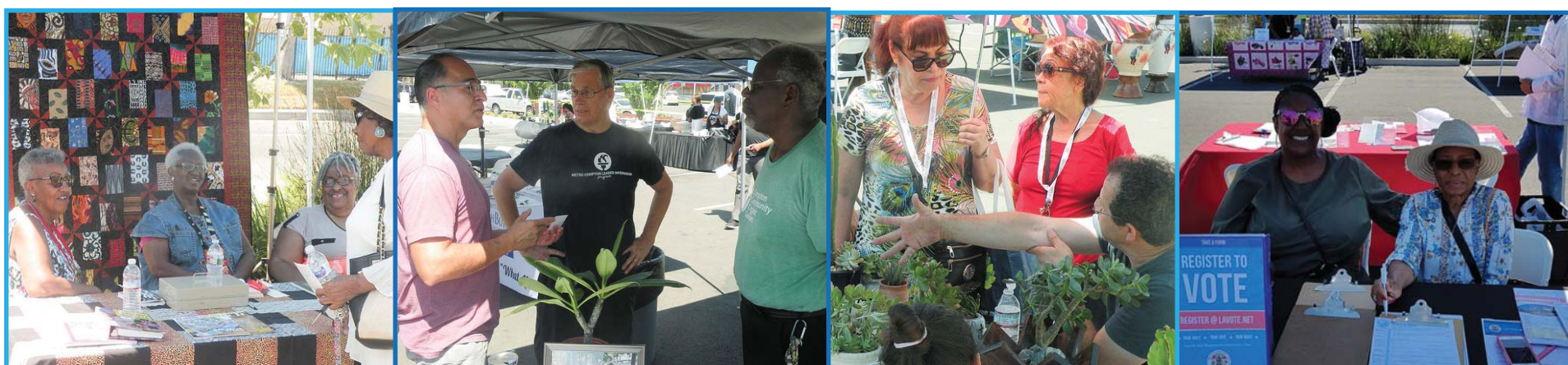
Vendors and residents enjoy the CSC Farmer's Market held on first Saturdays at the Center.