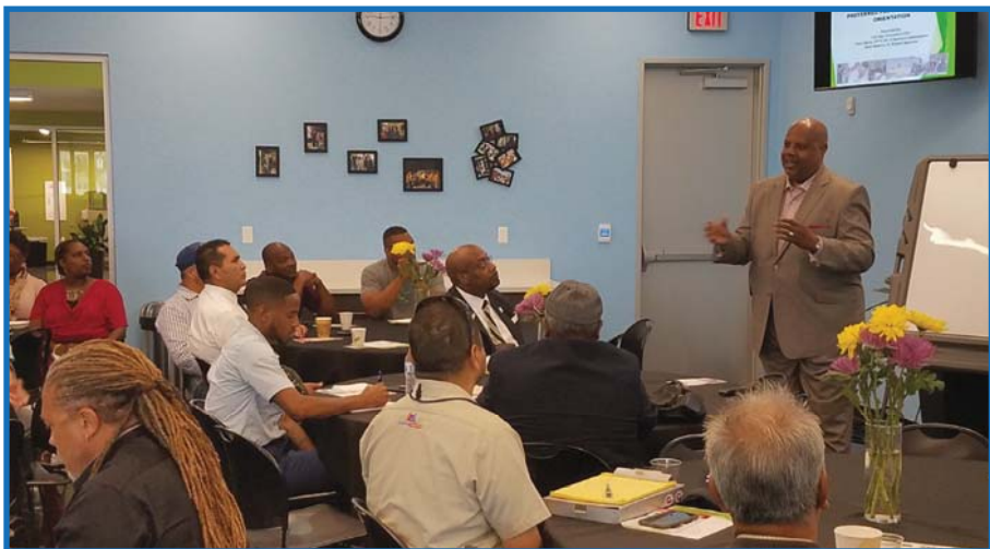
A business consultant with Pacific Coast Regional (PCR) speaks at the Contractors and Realtors Breakfast about ways to expand their business capacity and obtain certifications through PCR.