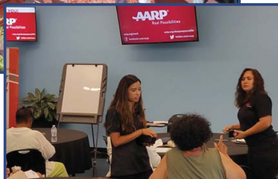
Community partners utilized the Center to provide valuable programs to the community. (top) California Highway Patrol conducted a car seat safety event and distributed new car seats to families in need. AARP conducted digital learning workshops for older adults.