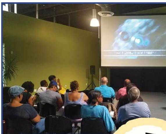
Movie Night screening of Marvel's Black Panther was enjoyed by residents and staff.